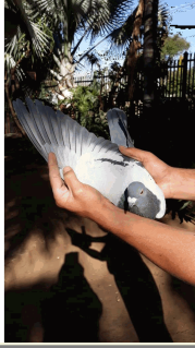
15231 ZAPRPC 19

Merwedestraat 1250 * Mountain View * Pretoria 0082 Tel: +32468414450 * Cell: +27835643578 * E-Mail: boshoffmc71@gmail.com