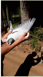
15230 ZAPRPC 19

Merwedestraat 1250 * Mountain View * Pretoria 0082 Tel: +32468414450 * Cell: +27835643578 * E-Mail: boshoffmc71@gmail.com