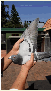
17297 ZAPWF 18

Super! Same bred brothers and sisters win and produce winners. Direct Son of 'Insomnia' mated to top impact breeding hen which is a gdr of 'De Rauw Sablon 817' Full sister of this cock '641' won 3X Club, 1st Fed Colesberg, and 2X 2nd Fed Leeu Gamka. She won Leeu Gamka locking on the day.