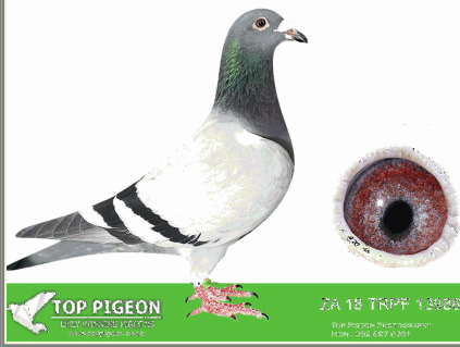
"TRIPPLE MIX MAN"

World renowned blood lines combine together from MDPR winner and One Loft Racing -SIRE: Full Brother to "JADZIA" - 7th Place SAMDPR 2019 Final Race- Bred by TRIPLE J LOFTS - Jurie Erwee-- DAM:"DON'T SLEEP"- Half sister to "MIX" SAMDPR winner 2018 -same Dam."MIX" BREAK AWAY winner of 2018 SAMDPR