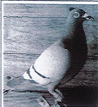
HILLCREST EIGHTY EIGHT, 2017 ZA17 SKDU 4088 HEN Family: MDPR Genetics This hen has been an absolute racing machine at Hillcrest Stud 5 X 1st prize at club level, Federation 1st/791, 3rd/816, 10th/536, 17th/776

1st club 12 members sent 64 birds 1st fed 90 members sent 673 birds 2nd club 15 members sent 76 birds 22nd fed 107 members sent 712 birds