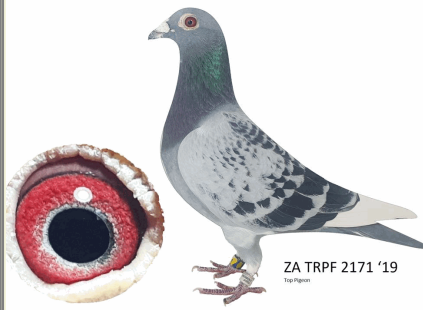
ZA TRPF 2171 '19 Top Pigeon

World renowned blood lines combine together from MDPR winner and One Loft Racing -SIRE: Full Brother to "JADZIA" - 7th Place SAMDPR 2019 Final Race- Bred by TRIPLE J LOFTS - Jurie Erwee-- DAM:"DON'T SLEEP"- Half sister to "MIX" SAMDPR winner 2018 -same Dam."MIX" BREAK AWAY winner of 2018 SAMDPR