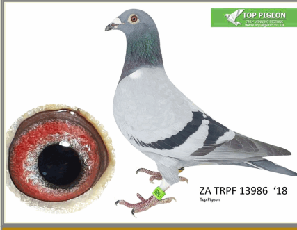
"TRIPPLE MIX MAN"

World renowned blood lines combine together from MDPR winner and One Loft Racing -SIRE: Full Brother to "JADZIA" - 7th Place SAMDPR 2019 Final Race- Bred by TRIPLE J LOFTS - Jurie Erwee-- DAM:"DON'T SLEEP"- Half sister to "MIX" SAMDPR winner 2018 -same Dam."MIX" BREAK AWAY winner of 2018 SAMDPR