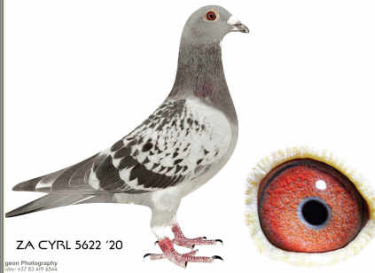
ZA CYRL 5622 '20

This Super Pair bred in the 2020 Season: - 6th Place Hotspot 1 SAMDPR - 51th Position Hotspot 5 SAMDPR - 37th Position Hotspot 5 DINOKENG - 24th Position DINOKENG 2020 Final - 54th Position DINOKENG Final 2020 Final