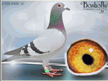
4408 ZAPWF 15

5 x Club Winner. Bred from click pair. Sire is inbred son of foundation hen 'Sunny Gold' and dam is linebred to 'Insomnia' The dam was 2nd final at Winners Flight Loft final. Her sire Terrie was 2nd Ace 4th Final Dinokeng. Her dam 'Jessie' won 8X Top 10 Dinokeng 2013, 2X 1st, 1X3rd, 9th ACE Pigeon.