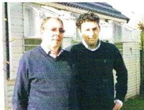
"HET BOLLEKEN" 09/4108109