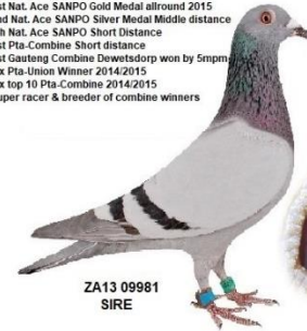
ZA13 09981 SIRE

1st Nat. Ace SANPO Gold Medal allround 2015 2nd Nat. Ace SANPO Silver Medal Middle distance 4th Nat. Ace SANPO Short Distance 1st Pta-Combine Short distance 1st Gauteng Combine Dewetsdorp won by 5mpm 3 x Pta-Union Winner 2014/2015 6 x top 10 Pta-Combine 2014/2015 Super racer & breeder of combine winners