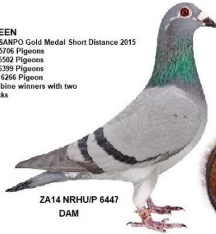
ZA14 NRHUIP 6447 DAM

1st Nat. Ace SANPO Gold Medal Short Distance 2015 3rd Against 5706 Pigeons 6th Against 5502 Pigeons 7th Against 6399 Pigeons 21st Against 6266 Pigeon Dam to Combine winners with two different cocks