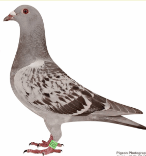
"MIX N MERGE"